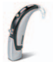
Versáta M with FM receiver attached