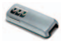
SmartLink FM transmitter

Discuss your communication and connectivity needs and wishes with your hearing care professional to find out which solutions are right for you.